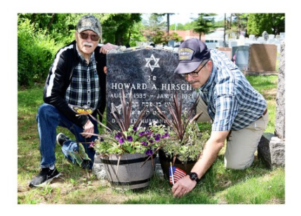
Placing Flags on Veteran Graves on Veterans' Day